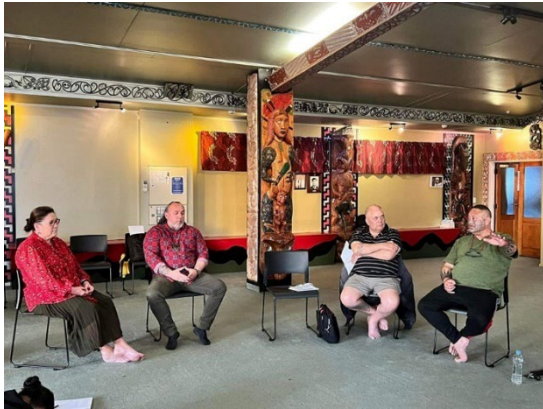
Paepae Reo, Kaikaranga Wānanga, Te Hotu Manawa.