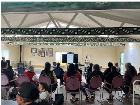
Supported x 3 initial hapu re- connection hui